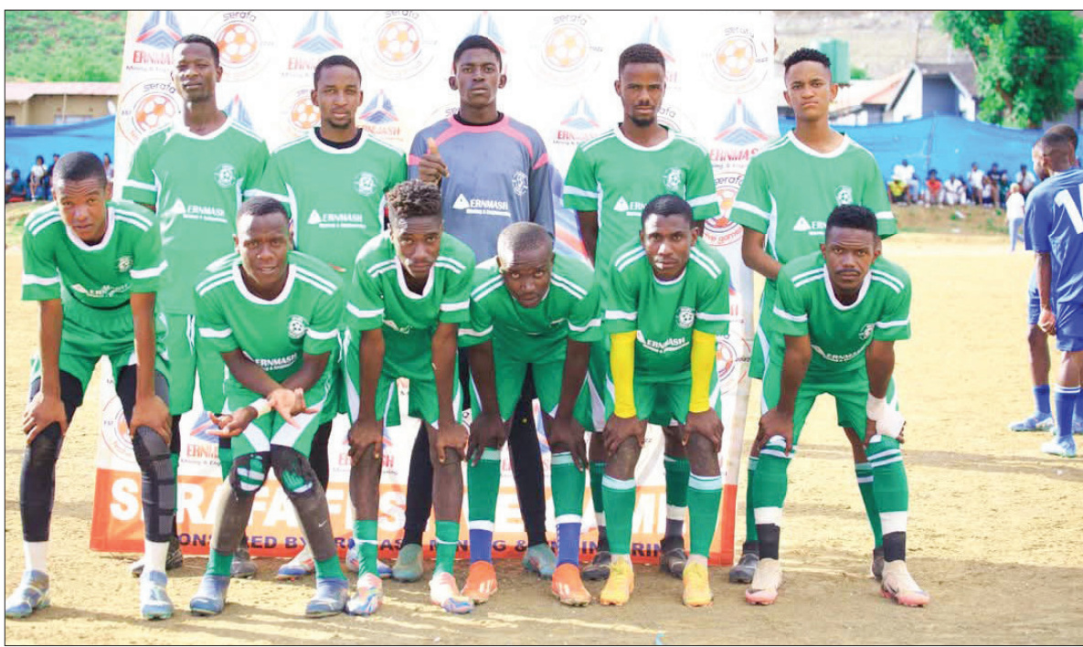
Manyaka Movers FC are hopefuls eyeing to win the Hollywoodbets SAFA Sekhukhune Football League Stream A.