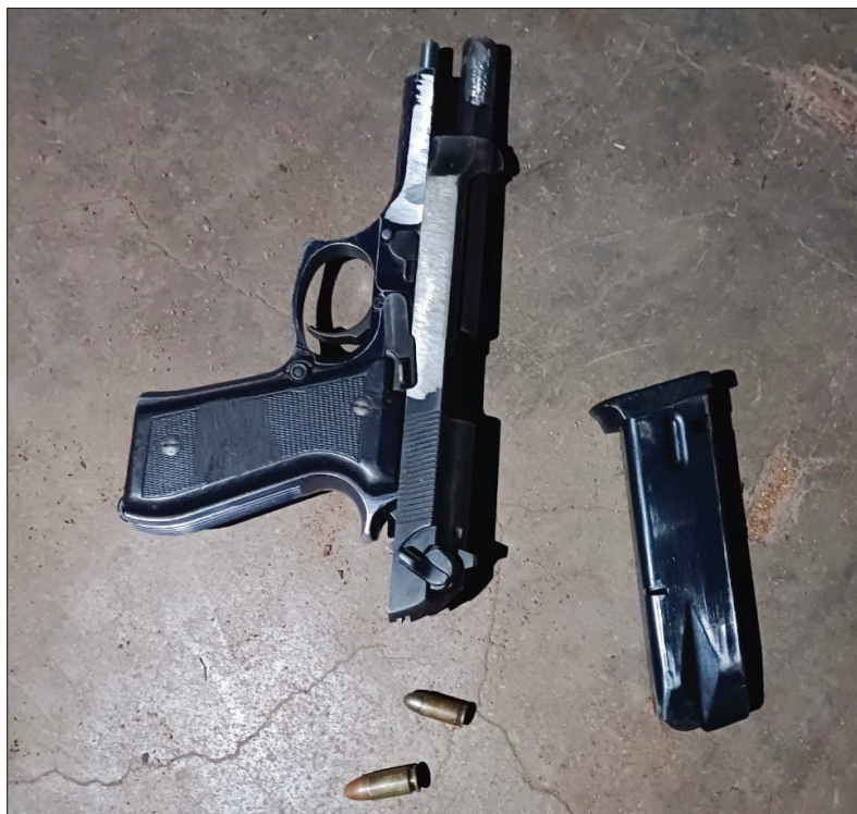
The unlicensed firearm and ammunition which were confiscated by the police when arresting the 26-year-old suspect.